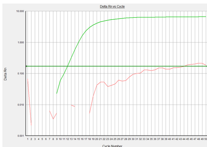
Figure 6 : Example of a signal that must not be considered for the results (red curve)

When considering the Ct figures obtained on a PCR test sample, ensure amplification curves are checked because automatic determination of the Ct by the software can sometimes provide a Ct that is due to a local fluorescence peak that has not to be considered as a PCR result (Figure 6).